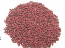
Red Yeast Rice Powder